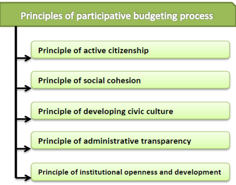
Figure no. 2 Principles of participative budgeting process

In summary, it can be noticed that the participatory budgeting process rests on a set of principles (see Figure no. 2):